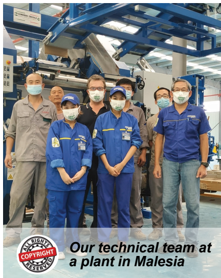
Our technical team at a plant in Malesia

L'aumento delle vaccinazioni e il miglioramento costante e generale della situazione sanitaria presente nel nostro paese hanno permesso a Comerio Ercole di ritornare sempre più vicini alla tanto attesa normalità. Un primo passo lo si è fatto ad Aprile con la fiera CHINAPLAS, prima fiera a cui Comerio Ercole ha preso parte fisicamente dall'inizio della pandemia e poi anche in Russia alla fiera Tires & Rubber di Mosca. Questo mese invece l'azienda ha potuto inviare dei tecnici specializzati presso clienti in Malesia, Russia e Polonia potendo tornare a svolgere presso gli stabilimenti dei clienti lavori e processi che fino al mese scorso venivano fatti con il servizio TELESERVICE che abbiamo ampiamente sviluppato.