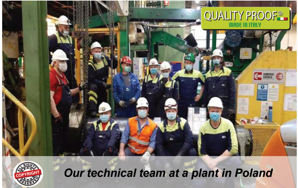
Our technical team at a plant in Poland